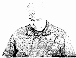
Has the time change caught up with Wheeler?