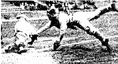
Mickey Cochrane in action at the plate